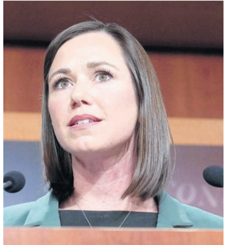
Sen. Katie Britt, R-Ala., speaks during a news conference on the border, Feb. 15, 2023, on Capitol Hill in Washington.